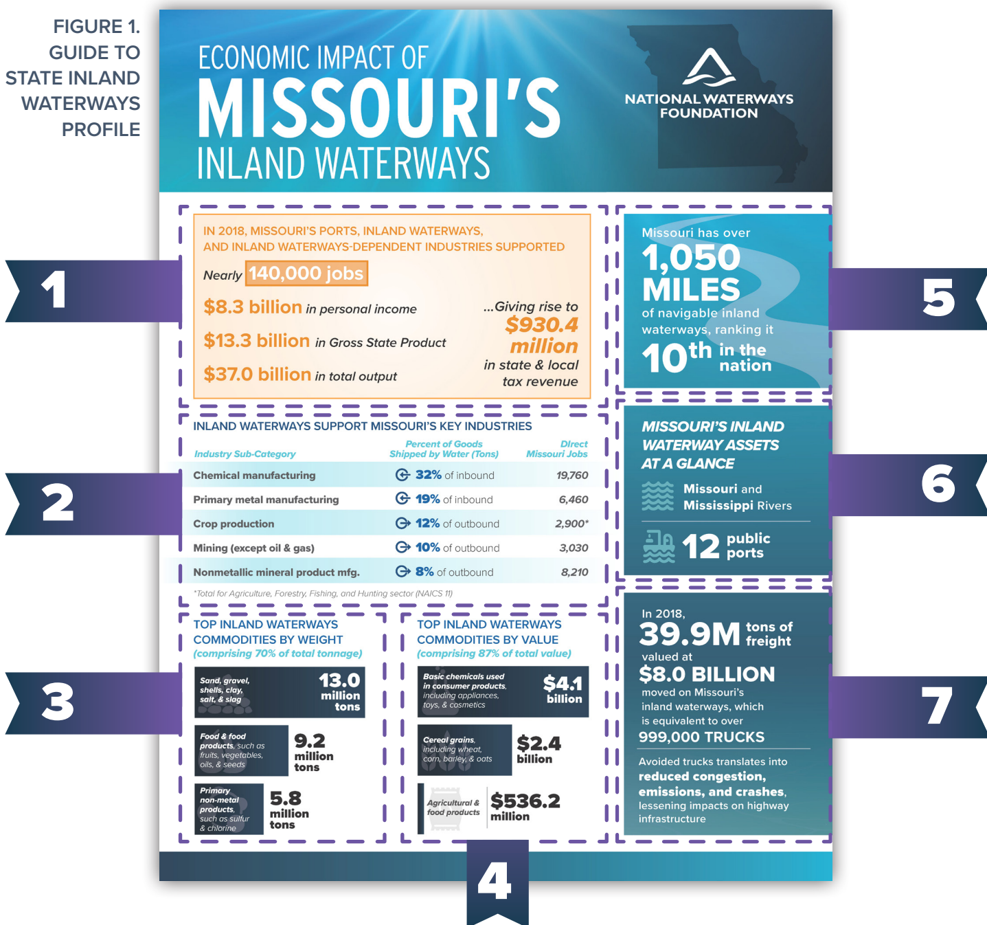
FIGURE 1. GUIDE TO STATE INLAND WATERWAYS PROFILE

The second page of the profiles are identical for all 17 states, and includes facts & figures that are individually sourced from published studies and reports.